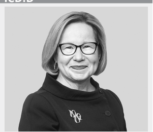
Ontario, Canada Age: 63 Director since: 2015 Independent

2019 Voting Results: For: 99.94 % Withheld: 0.06 %